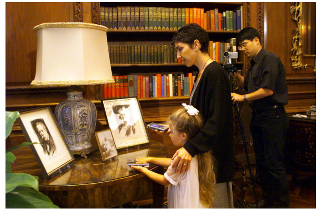
Figure 2: Observation of visitors using the guidebook.

The visitors used the electronic guidebook in the next two rooms of the house. One of these rooms contained security barriers and the other did not. The visitors received brief instructions from the research escort in the use of the guidebook. They were then asked whether they would each like their own guidebook or if they would prefer to share. They were also offered headphones. They were told that they could change their decisions at any time and that the research escort would answer